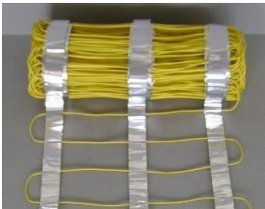
QuickMat – Radiant Floor Heating Information on Pg. 31

We recommend that you contact a U.S. Heating System Consultant when deciding what heating solutions are best for your needs.