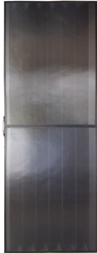
SH27 – Solar Air Heater Information on pg. 10