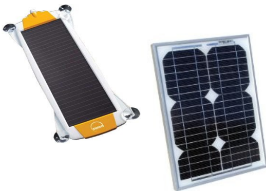
Standalone Solar Power Kits Information on pgs. 8 & 20