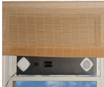
DSH – Solar Air Heater Information on pg. 21